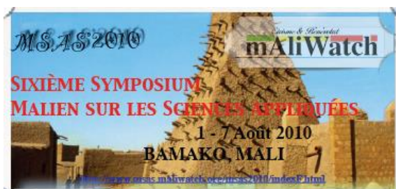
Figure 1. Symbol of the MSAS2010

Figures and tables should be identified by Arabic numerals and positioned within the text. Illustrations and graphics may be one- or two-columns wide and should include captions or titles.